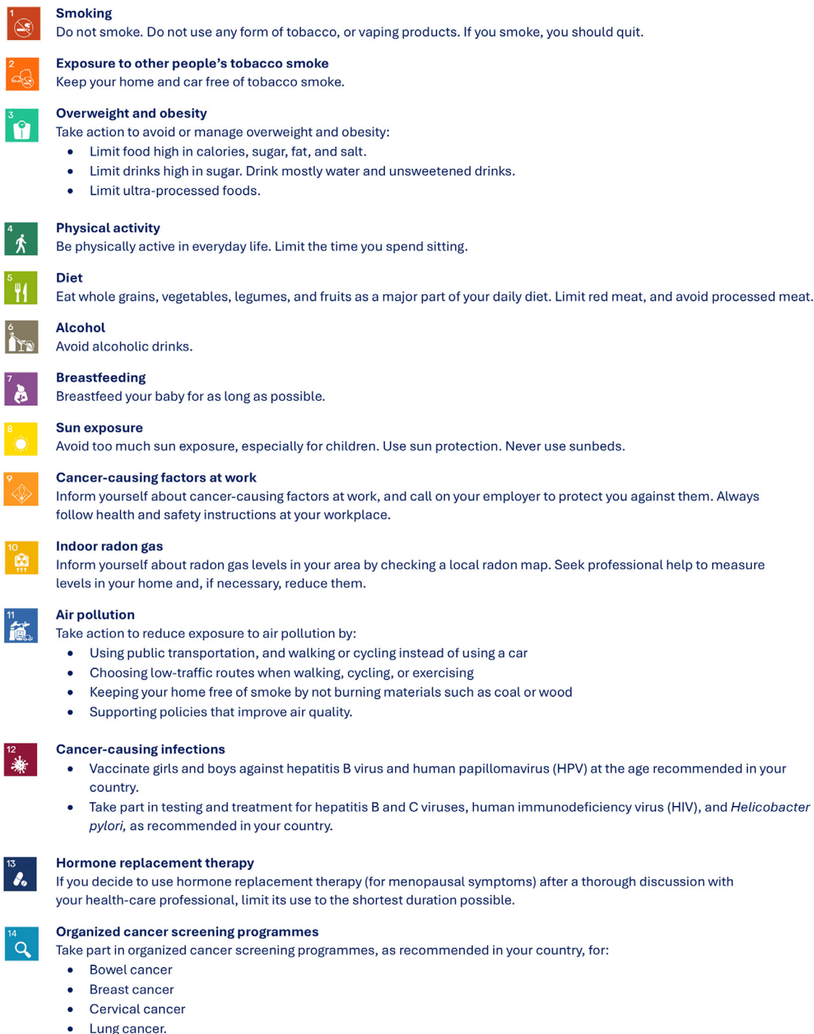
Fig. 1. European Code Against Cancer, 5th edition: recommendations for individuals. The 14 recommendations of the European Code Against Cancer, 5th edition (ECAC5) adopted by the Scientific Committee of the ECAC5 project.