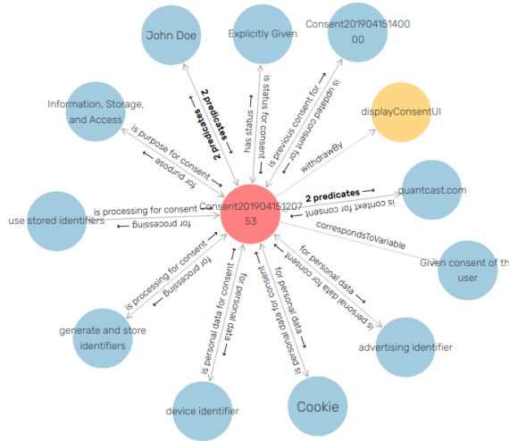
Fig. 2. Visualisation of Given Consent in the data graph (using GraphDB)

In the consent dialogue, the use of independent radio buttons was interpreted as allowing the user to consent and withdraw for each individual purpose, which was represented by creating separate instances of consent for each choice. We modelled the dialogue as an instance of gdprov:ConsentAgreementTemplateBundle consisting of several gdprov:ConsentAgreementTemplate instances to represent multiple individual consent entities. We had difficulty in interpreting the language used for third parties as it suggests the user is giving consent directly to third parties rather than to Quantcast. Pending clarification from legal experts, we chose to represent these as data recipients rather than as Controllers or Joint-Controllers for ease of testing. This allowed us to represent the data sharing processes in a concise manner with each purpose being associated with the hundreds of third parties listed in the consent dialogue rather than defining a separate consent representation for every third party. For testing, we defined an instance of given consent (see Fig 2.) which was then later withdrawn. All resources associated with the data, constraints, and queries are available online 3 .