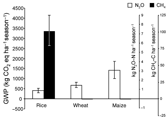
Fig. 1 Results of a meta-analysis on net seasonal soil fluxes of CH 4 and N 2 O from three cereal crops. For N 2 O fluxes, the results for rice, wheat and maize were based on 116, 122, and 88 observations, respectively. For CH 4 fluxes, the results were based on 116, 33, and 8 observations. Observations were weighted by sampling frequency and replication. All error bars represent 95% confidence intervals.

The GWP of CH 4 and N 2 O emissions from rice systems was largely determined by CH 4 emissions (100 kg CH 4 -C ha -1 season -1 ) that accounted for 89% of the GWP. Three rice studies (Ma et al. , 2007, 2009; Shang et al. , 2011), all from China, reported extremely high CH 4 emissions in excess of 20 000 kg CO 2 eq ha -1 sea-