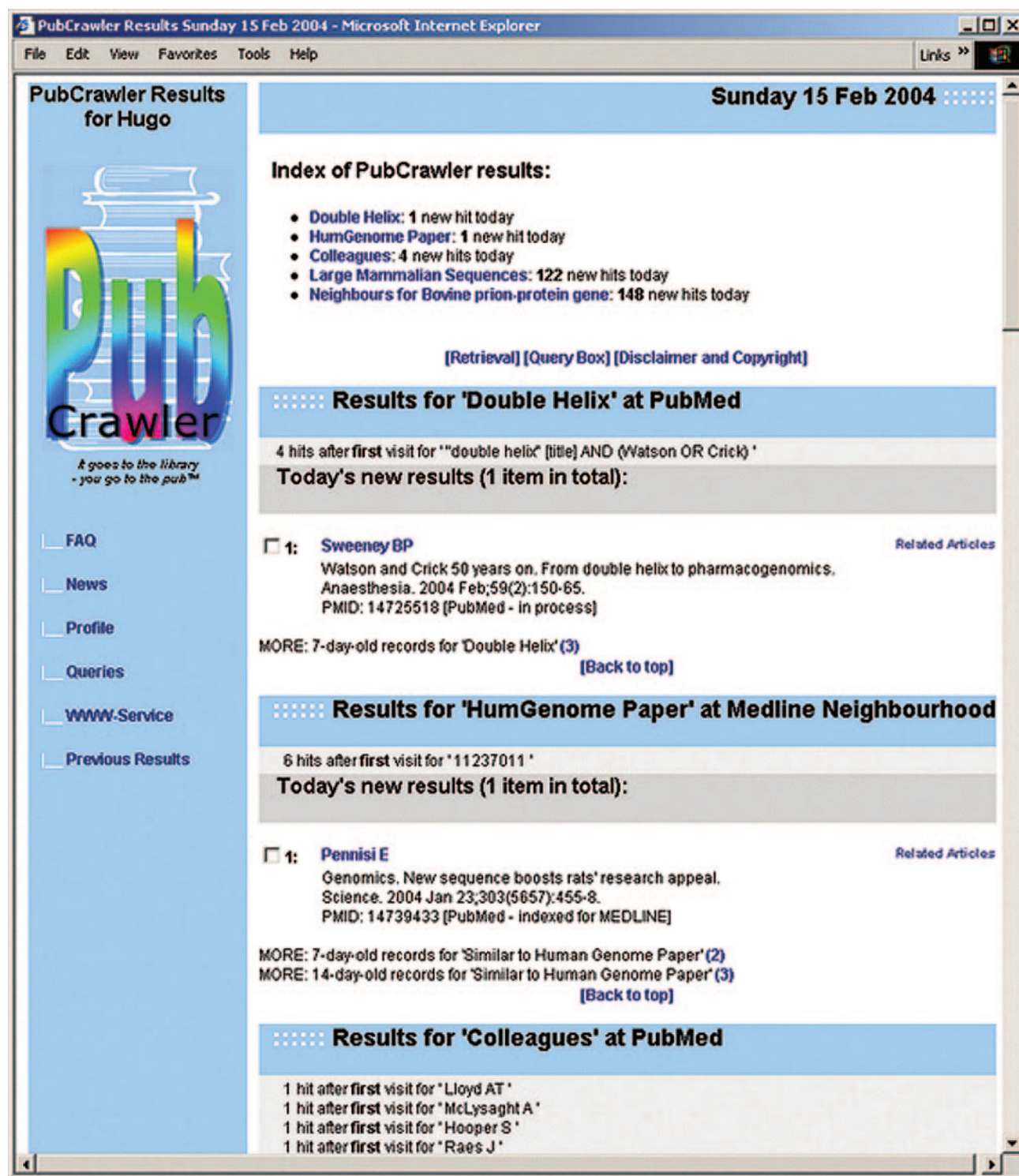
Figure 1. A sample output from a PubCrawler results page. An index at the top provides a quick overview of how many new results were retrieved for each query. Aliases can be used to provide descriptive handles for them. Numbers are reported for the total amount of hits and for the previously unseen items that are filtered out for presentation. Older hits are accessible through links up to an adjustable age limit. Multiple queries can be combined under the same alias. Hyperlinks help navigating through the page to get easily from one section to the next. For each article or sequence a checkbox is provided. Using these allows narrowing down the list of interesting items, which can then be retrieved with the click of a button in a format of choice from the NCBI site.

option. All submitted data are treated with the strictest confidence. Nevertheless, the transparency of the Internet should caution users not to provide sensitive passwords or addresses.