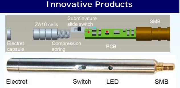
Figure 1: Low cost, high specification electret microphone

In each of these cases, full working prototypes were made, operated and tested