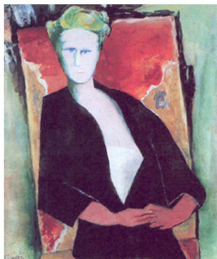
Self Portrait, 1948-1986

In Ireland, she was honoured by being elected to Aosdana.