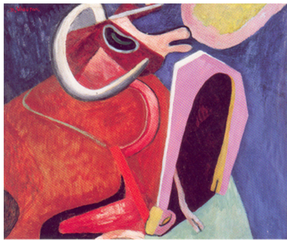
A dying Animal, c.1943