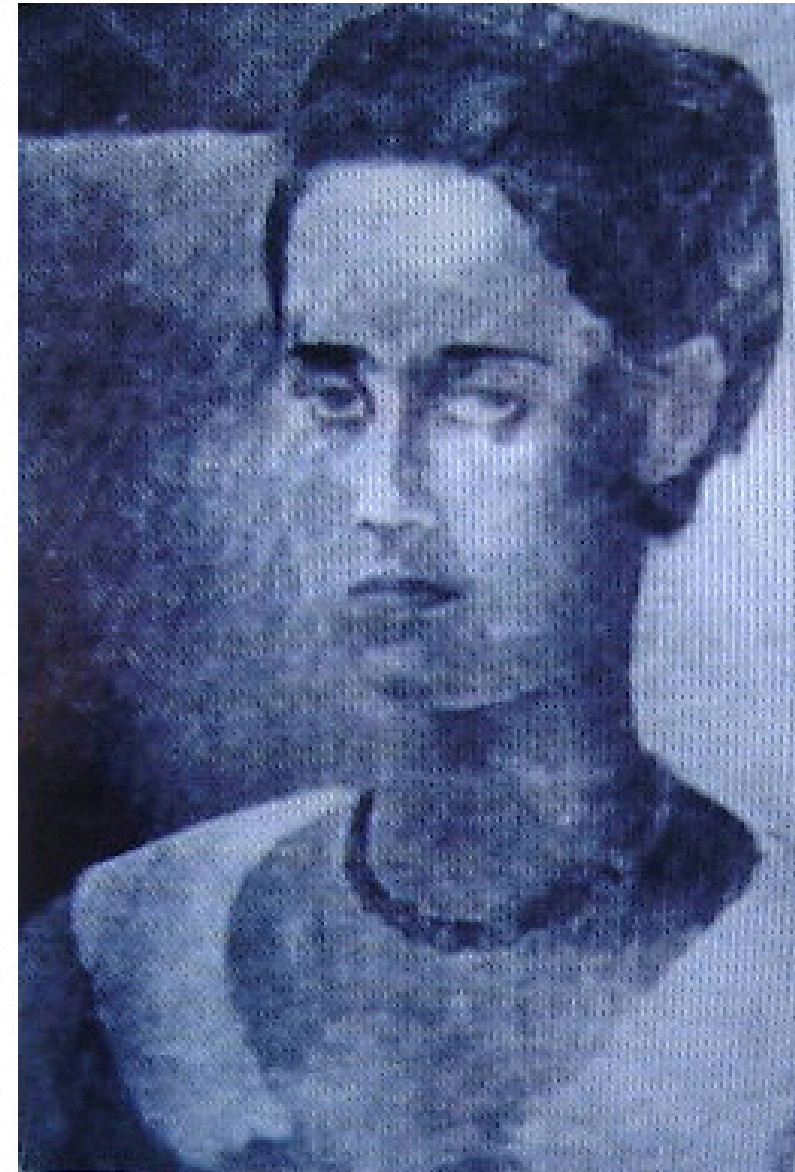
Self portrait, c.1931