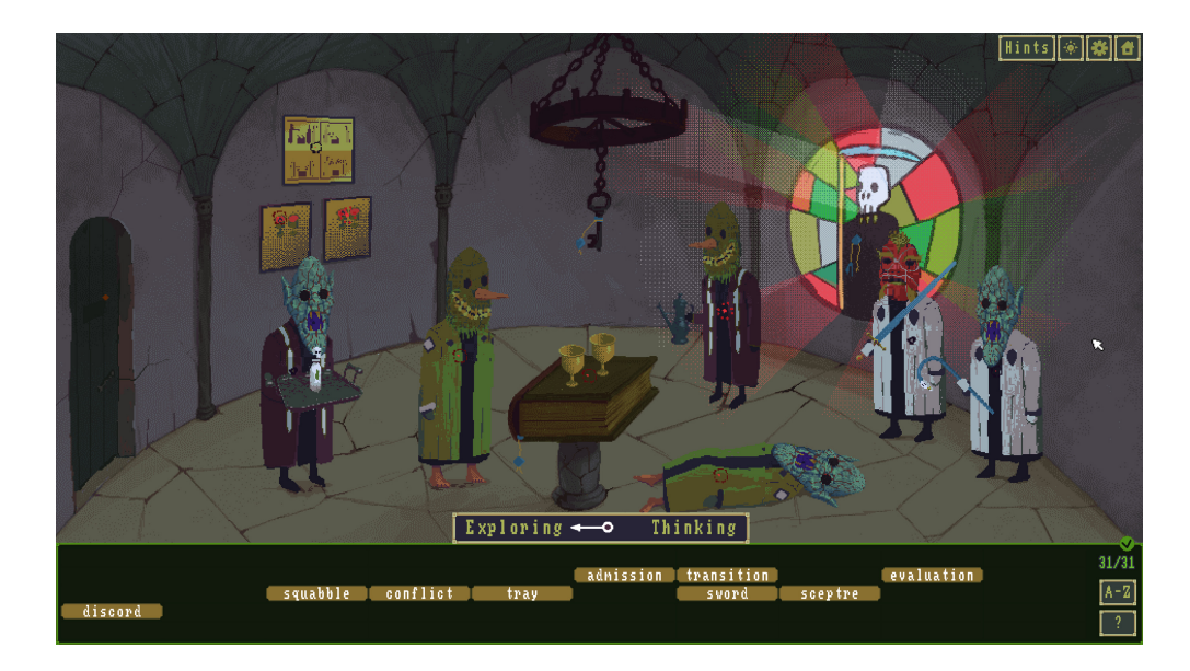
Fig. 1. A screen from The Case of the Golden Idol.

narrative puzzles is closely tied to Bogost's theory of procedural rhetoric wherein an idea is conveyed effectively through computational processes rather than audiovisual means [3]. Narrative puzzles challenge the player to understand a game's systems, how these systems interact with each other and how they can be manipulated by the player to create a desirable outcome. Bogost relates interactivity in the context of procedural rhetoric to the Arsitotelian enthymeme where a proposition in a logical argument is omitted and it is the responsibility of the listener (or player in the case of a game) to intuit this proposition and complete the argument. With regards to narrative puzzles, puzzles must be designed such that a player can intuit the solution based on their understanding of what the game's systems afford, i.e., the game's procedural rhetoric. A key must open a lock, water must quench a fire, a healing potion must heal, and so on.