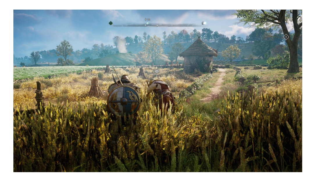
Fig. 4. The Doom Book of Cats puzzle space; the farmer is in the middle ground and the woman is in the background. From Assassin's Creed: Valhalla .