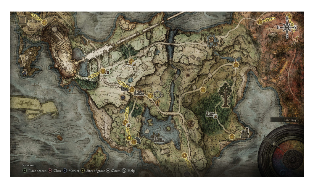
Fig. 3. The main map in Elden Ring.

by the item description. Doing so will eventually bring them to the relevant fort. They must also find the location of the Lift, which the item description notes is used to connect the Altus Plateau to Liurnia (the only area through which the Altus Plateau is accessible). To do this, they need to explore the border of Liurnia using the map or use the map to find locations that appear to be significant and investigating them.