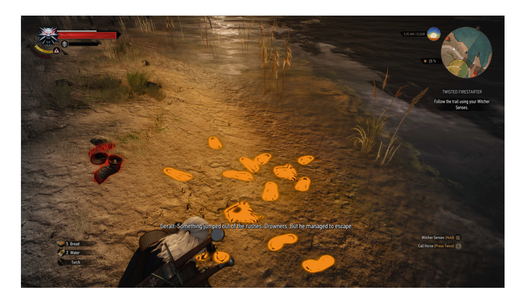
Fig. 5. Footprints visible in the mud through use of the Witcher Senses. From The Witcher 3: Wild Hunt .

with enough information such that while they require more actions to solve than the puzzle in ER, the mental challenge presented is minimal.