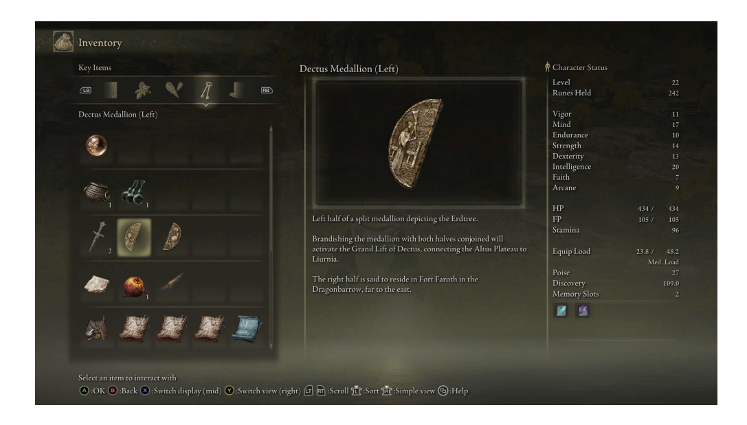
Fig. 2. Item description for Dectus Medallion (Left) in Elden Ring.