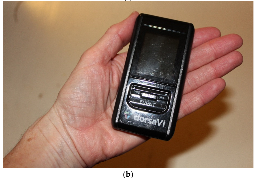
Figure 1. (a) ViMove<sup>™</sup> sensor location; (b) Pocket recording device used by participant.