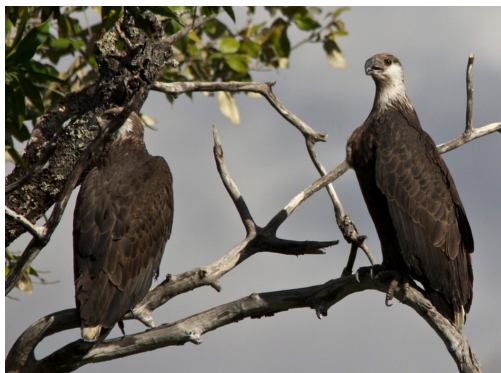
Figure 4. Madagascan Fish Eagle Haliaeetus vociferoides.