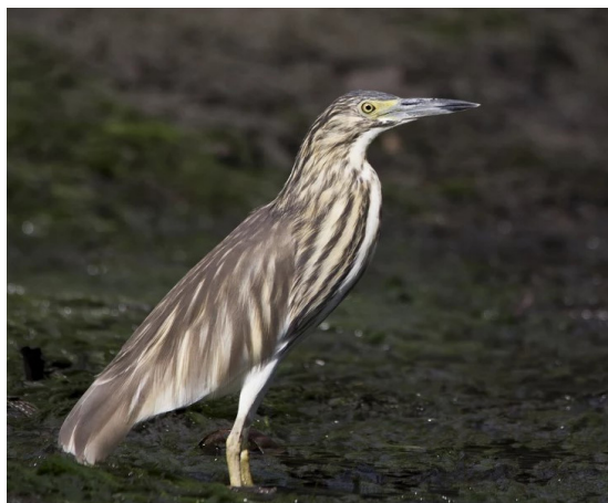
Figure 3. Malagasy Pond Heron Ardeola idae.

A rare migrant. We have occasionally observed single individuals on sandbanks along mangrove-fringed channels (Fig. 3). The species has a widespread but small population throughout Madagascar, where it breeds in the austral summer between October and March (BirdLife International 2020d). The population of this species has declined substantially in recent decades due to habitat destruction and exploitation at breeding sites (Rabarisoa et al. 2020), and the global population is now estimated at just 1100 breeding birds. The species winters