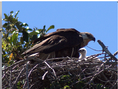
Figure 5. Breeding Haliaeetus vociferoides.