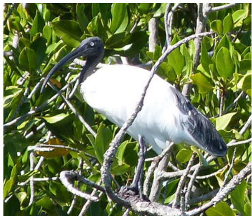
Figure 2. Malagasy Sacred Ibis Threskiornis bernieri.

A rare resident. Singles and pairs were observed several times by BAR on sandbanks alongside mangrove-fringed channels in 2011 and 2013 (Fig. 2). The presence of this species here is not unexpected, given known distributions suggest a theoretical occurrence in suitable habitat anywhere on the west coast of Madagascar, and particularly as this section of coast corresponds to the core part of its range (Safford & Hawkins 2013). However, it has not been explicitly reported from Ankobohobo Wetland previously, being absent from the IBA summary for this site (BirdLife International 2020a).