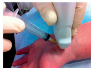
Fig. 2 Image of US-guided carpal tunnel syndrome injection

The combined role of US as a diagnostic tool and to guide injections is an efficient and cost-effective way to deliver service to patients. In one study, 87% of patients attending a musculoskeletal medicine clinic had a definite diagnosis and treatment initiated on their first visit due to the use of US and US-guided injection [76]. One study compared US-guided injection vs blind injection of the carpal tunnel [77]. Improvement in symptom score on the LKQ was significantly greater in the US-guided injection group at 12 weeks and symptom relief occurred significantly more quickly in this group as well (4.11 vs 6.23 days) compared with the blind injection group [77]. There were no major adverse events noted in either group (nerve or blood vessel damage) [77]. An image of a US-guided injection at the level of the distal wrist crease using a radial approach is shown in Fig. 2 and a video clip of a US-guided injection is available online (see supplementary material, available at Rheumatology Online). US guidance has also been shown to lead to a better pain and functional outcome in other joint injections [78]. The accuracy