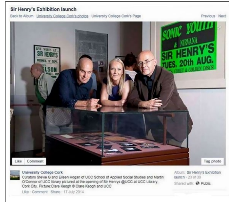
Sir Henry's Curators

From his experience of coordinating the Sir Henry's