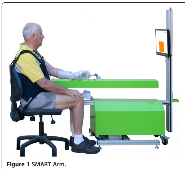
Figure 1 SMART Arm.

A prospective, assessor-blinded, three group parallel RCT will be conducted with 75 stroke survivors with severe upper limb disability who are undertaking inpatient rehabilitation (Figure 2).