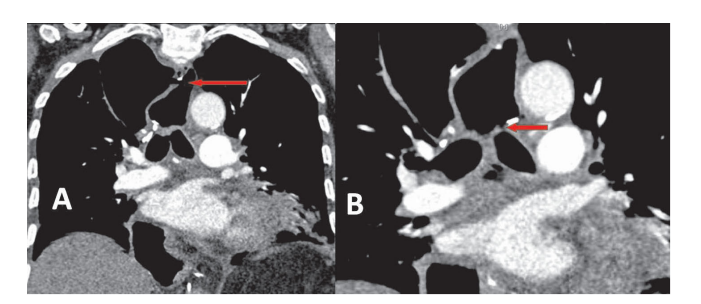
Figure 2 CT thorax showing the mediastinal collection of air with a single, long fistulous communication between the esophagogastric anastomosis located the neck (A) and the left main bronchus (B).

He was managed conservatively with antibiotics, enteral nutrition via a jejunostomy, and non-invasive respiratory support in the form of humidified oxygen via face mask and chest physiotherapy. The huge amounts of air in the