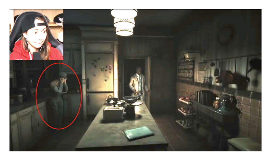
Fig. 5. Playable character Etienne Bertrand encountering deceased, previous playable character Alina Ramos sobbing in the kitchen (highlighted in red). (Color figure online)

In comparison, cosmic horror deliberately eschews this orderly and familiar representation of the world. As noted earlier, cosmic horror frequently deals with the inde scribable , and this also pertains to the perception of spaces and places in the stories. Perhaps the clearest example is from what is probably H. P. Lovecraft's most famous story "The Call of Cthulhu" in which he writes: "[T]he geometry of the dream-place [...] was abnormal, non-Euclidean, and loathsomely redolent of spheres and dimensions apart from ours" [13]. While Lovecraft only used the term "non-Euclidean" a couple of times in his stories, he returns to the subject in letters, such as the following: