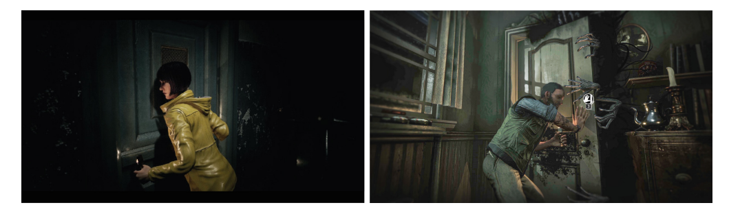
Fig. 1. Game mechanics in Song of Horror (2020): listening at doors (left) and keeping the monsters out (right)

in the next room and (less frequently) keep a door closed to keep the monster away, at least for a short while. The radio in the (non-Lovecraftian) game Silent Hill 2 (2001) also falls into this category; it serves a gameplay function by alerting the player to the presence of monsters but its uncanny static also creates a feeling of danger and vulnerability. Survival horror games, like the Silent Hill series, frequently feature game mechanics that emphasise danger and powerlessness, even when they are not Lovecraftian, and these are straightforward to use also in Lovecraftian games.