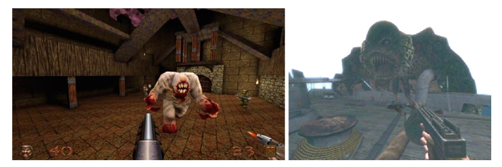
Fig. 2. Left: Lovecraftian monster from Quake (1996). Right: The monstrous Dagon from Call of Cthulhu: Dark Corners of the Earth (2005)

emphasises the antagonist's power. Chrono Trigger is not a cosmic horror game, and it does let the player prevail in the end, but its repeated defeat structure is a useful approach that can be adopted by cosmic horror games to help show the overwhelming power of the opponents.