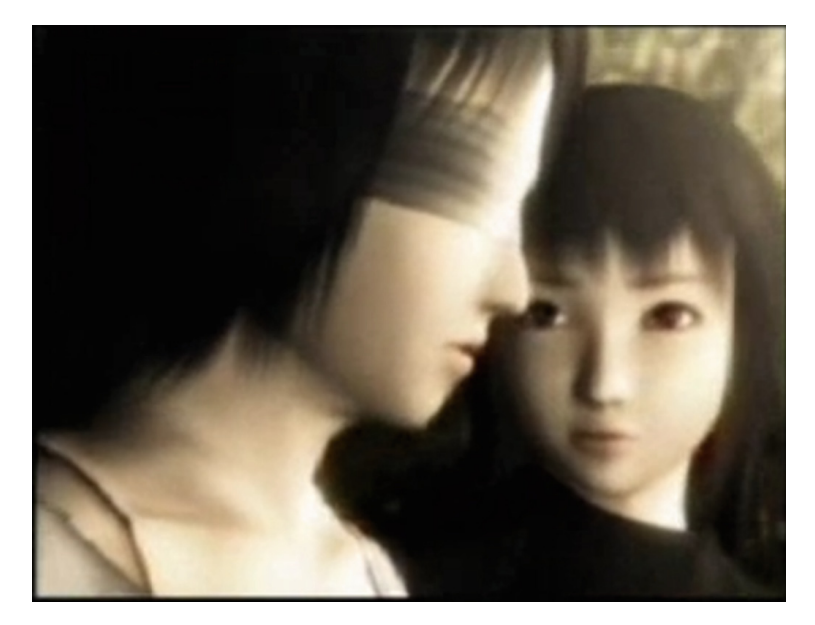
Fig. 3. The "nightmare ending" in Fatal Frame 2 (2003)

Cosmic horror stories tend to be short, perhaps because the horrors are so immense and so terrible that their effect is always quick and detrimental. It is rare to find a cosmic horror story that features a long, drawn-out survival of the protagonist, but prolonged survival is of course the convention in games, even for games that, like Call of Cthulhu: Dark Corners of the Earth, feature the ultimate demise of the playable character. In this fashion, the survival of the playable character is linked to the duration of the game.