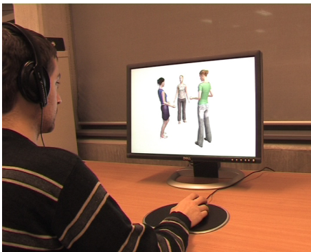
Figure 4: Participant in Localized Audio experiment.

The experiments were run on a workstation with 4GB of RAM, a Creative SB Audigy 2ZS soundcard and an 8-series G-Force graphics card. The stimuli were displayed on a 24-inch widescreen monitor and participants used Sennheiser HD 202 headphones to listen to the audio (Figure 4). Participants viewed each trial for 10 seconds and were asked to indicate using a mouse click whether they thought that the conversation they viewed was real or synthetic . We found through interviewing participants that 10 seconds was an adequate time for them to make their decisions. We randomly associated the right or left mouse button with the real response so as to avoid any bias towards a particular button-press. Similarly, 50% of our stimuli were real, in order to avoid any bias. After a participant gave his/her response, a cross was displayed to focus attention on the centre of the screen.