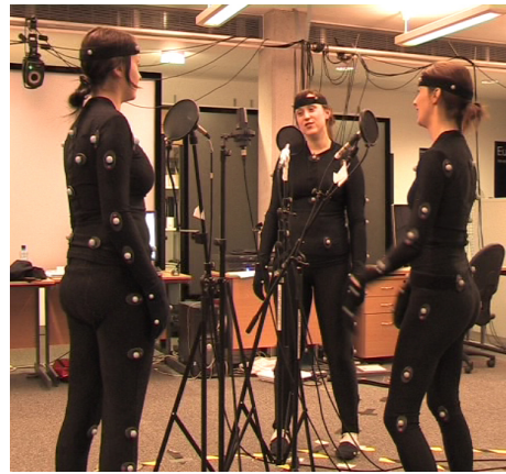
Figure 2: Our audio and motion capture setup with three female actors.

Two sets of actors participated in recording sessions where we recorded both their voices and body movements. The first set contained three males aged between 25 and 31. The second had three females aged between 22 and 28 (see Figure 2). We chose two groups of actors in order to test if our results were generalizable. Briton and Hall [1995] found that female actors were more expressive with gestures and that female participants rated female gestures higher than male gestures, which were found to be less fluid and more interruptive. We chose groups of three to allow us to capture group dynamics that would not be as present if using groups of two, such as turn taking, interruptions and gaze shifting. All actors were non-professionals and were accustomed to the motion capture setup and environment. We also ensured that actors knew each other and were informed about the topics that they would be discussing in advance, in order to ensure natural, realistic conversations.