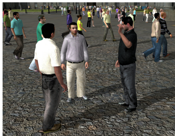
Figure 1: Screenshot of our real-time crowd system with dynamic agents and conversing groups.

Many developments have been made in real-time crowds over the past years, with video games such as Assassin’s Creed involving the investing of significant resources into developing interactive and believable crowds [Bernard et al. 2008]. However, still missing from real-time crowd applications is the concept of realistic conversing